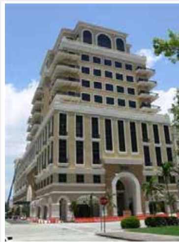
2020 Ponce, an elegant, full-service Class A office building located at 2020 Ponce de Leon Blvd. in the Coral Gables business district, has received a Certificate of Completion.

2020 Ponce will welcome its first occupants in the next few weeks as build-outs for several early purchasers are underway. 2020 Ponce has 40,000 square feet remaining of customizable, designer-ready layouts that range from 500 square feet up to a full floor of 16,500 square feet, available for purchase or lease. The column-free floor plans can result in efficiencies of up to 30% in space planning. Colliers Aboud Wood-Fay, a full service commercial real estate firm headquartered in Coral Gables, is the leasing agent for the property.