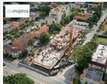
Consisting of 36, luxurious townhome residences, Villa Majorca is located at the intersection of Majorca Avenue and Le Jeune Road.