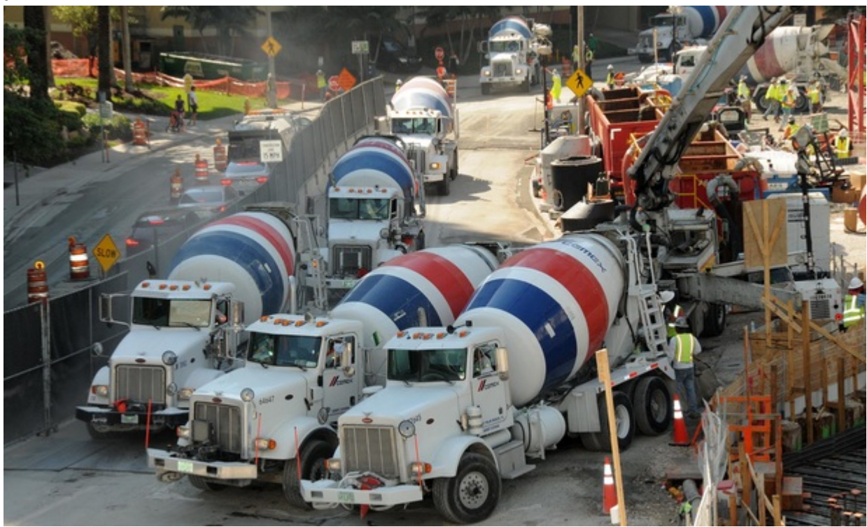
Jill Kahn5 of 7

Construction of Panorama Tower, 1101 Brickell Ave.