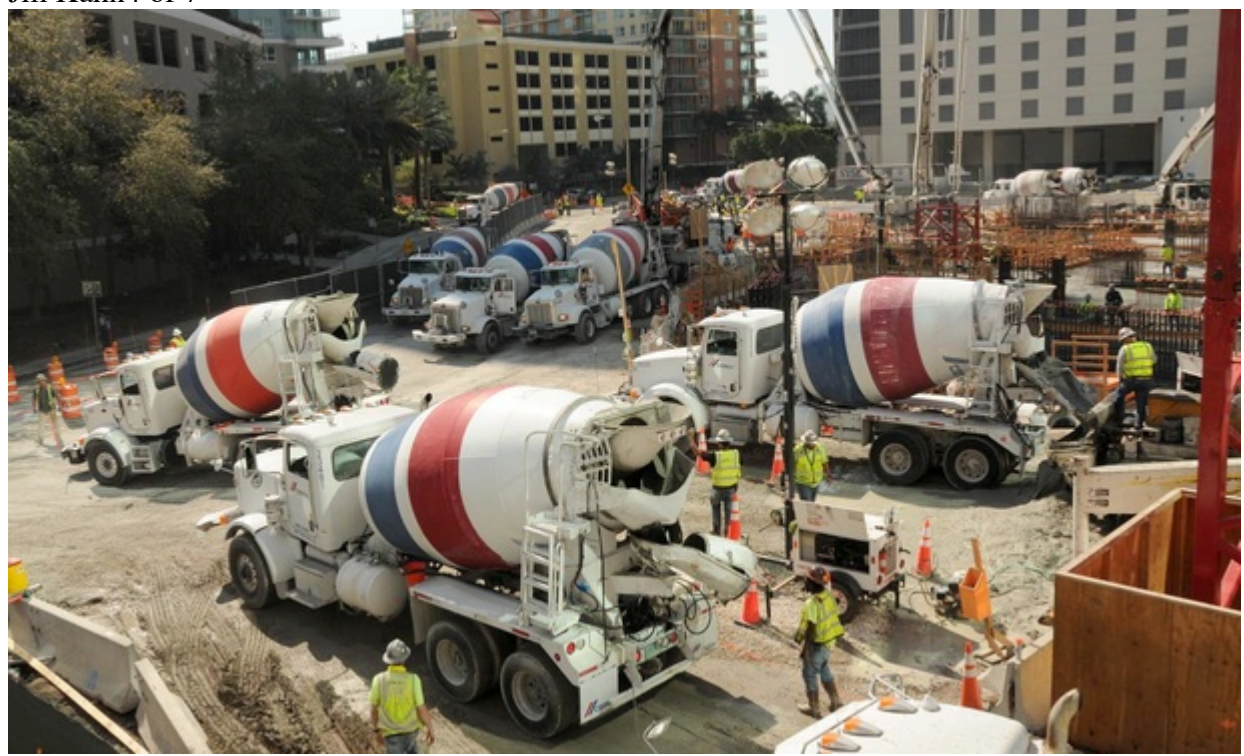
Jill Kahn4 of 7

Construction of Panorama Tower, 1101 Brickell Ave.