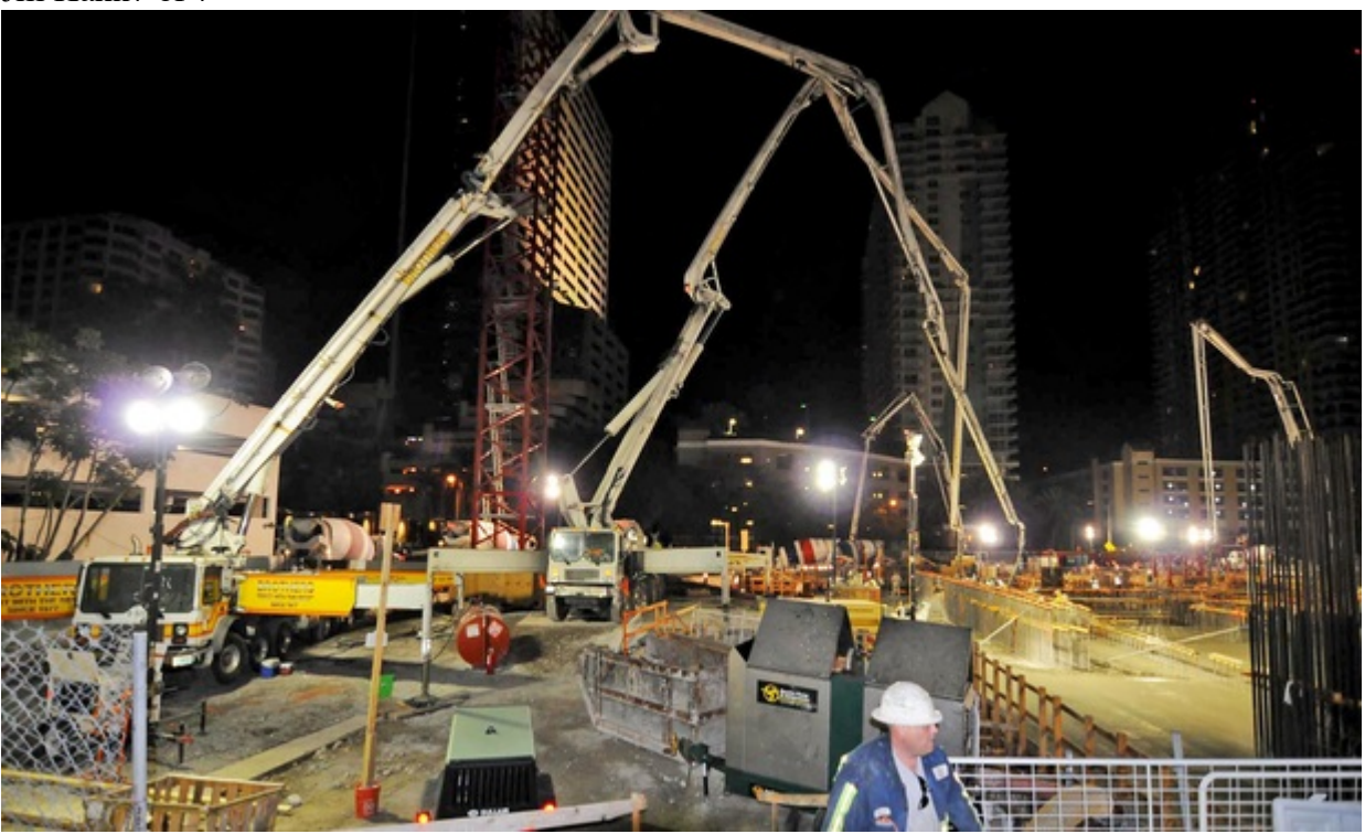
Jill Kahn7 of 7

Construction of Panorama Tower, 1101 Brickell Ave.