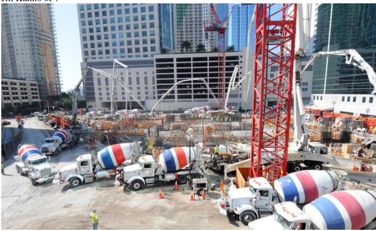
Jill Kahn6 of 7

Construction of Panorama Tower, 1101 Brickell Ave.