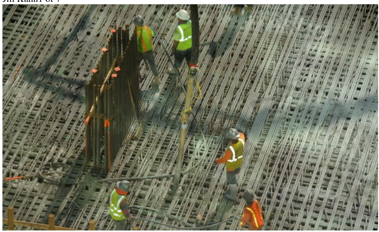
Construction of Panorama Tower, 1101 Brickell Ave.