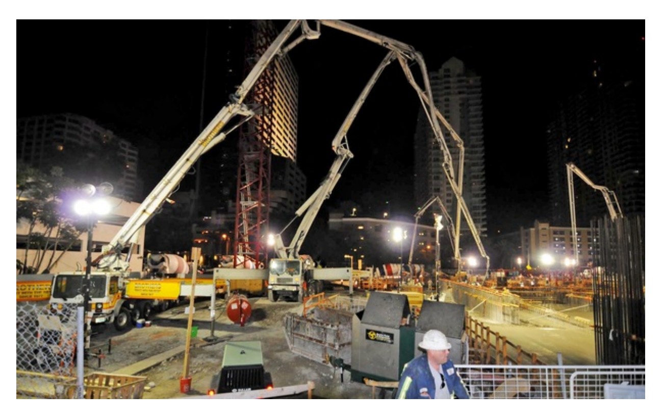
Construction of Panorama Tower, 1101 Brickell Ave.