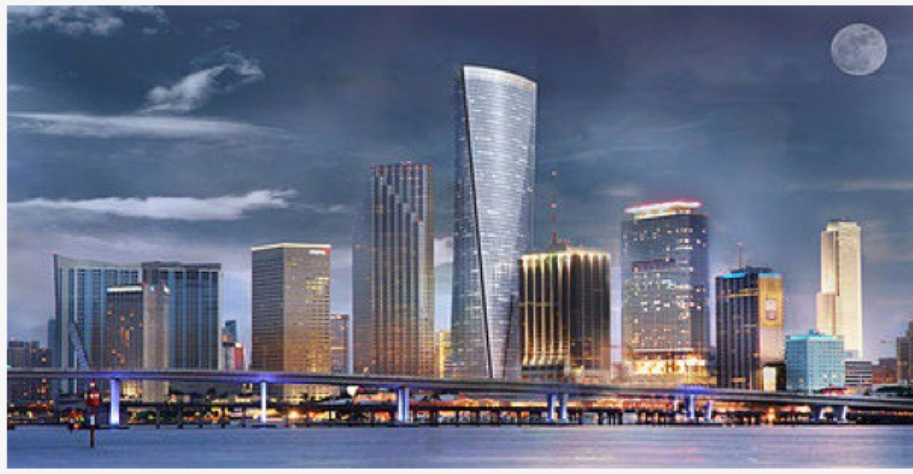
A rendering of One Bayfront Plaza

The building would not only become the tallest in Miami and Florida but also the entire southern United States. Atlanta's Bank of America Plaza currently holds that title by standing 1,023 feet high.