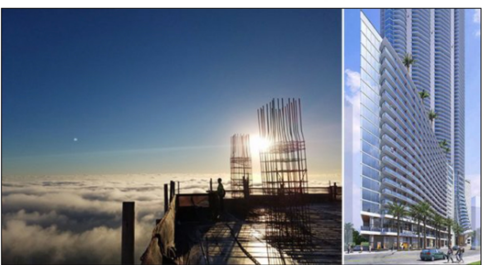
View from the 76th floor of Panorama and a rendering of the tower

At 85 stories and 830 feet tall, Florida East Coast Realty's Panorama Tower will add new heights to Miami's skyline when the skyscraper tops out.