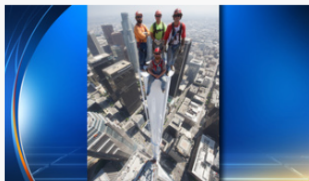
Insane photo shows workers sitting atop new building