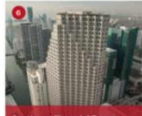
Southeast Financial Center (formerly Wachovia Tower) Year built: 1981 Height: 55 stories