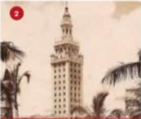
Freedom Tower Year built: 1925 Height: 17 stories