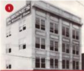
Burdines Building Year built: 1912 Height: Five stories

In 1912, the tallest building in Miami was the Burdines Building, at five stories. The tallest building today, when complete, will be Panorama Tower, at 85 stories. Several developers have plans to build above 1,000 feet in the near future.