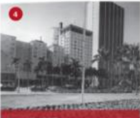
New World Tower (formerly BankAtlantic Building) Year built: 1963 Height: 30 stories