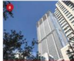
Panorama Tower Year built: 2018 Height: 85 stories