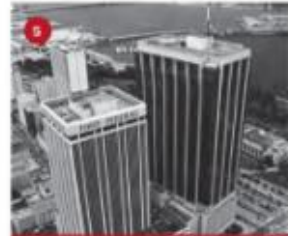
One Biscayne Tower Year built: 1971 Height: 40 stories