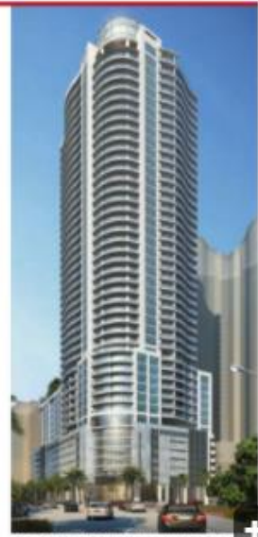
The 100 Las Olas tower would be 499 stories tall with 228 hotel rooms and 120 condominiums.