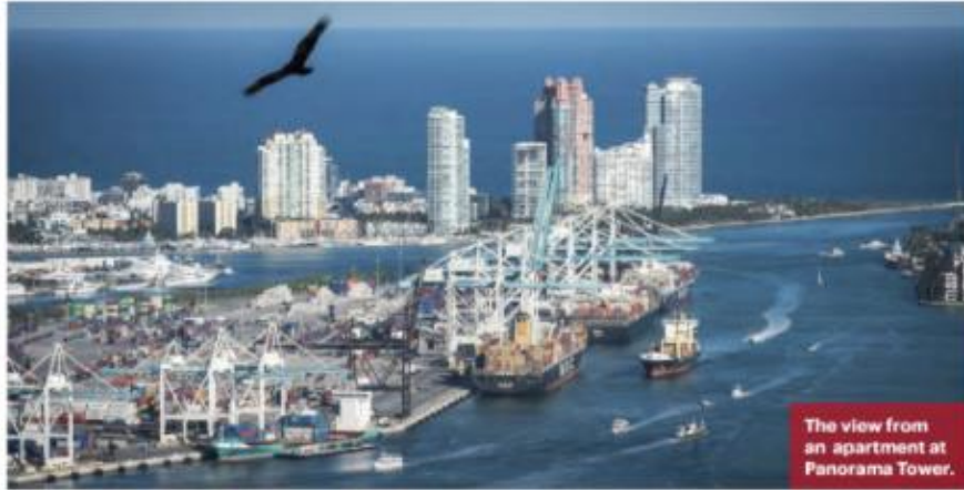
The view from an apartment at Panorama Tower.

"The investment alone in design and approvals is a massive one," Warhaft said. "It takes very deep pockets to even think about doing one of these projects."