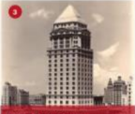
Miami-Dade County Courthouse Year built: 1928 Height: 27 stories