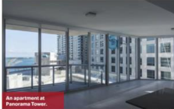
An apartment at Panorama Tower.

In many major cities, office is the primary use for skyscrapers, but that could be more difficult in Miami. That's because the 30,000-square-foot office floor plates allowed under the Miami 21 zoning code are significantly smaller than what most financial institutions and big technology tenants require, Warhaft said. One Bayfront Plaza won't have that problem because its 36,000-square-foot