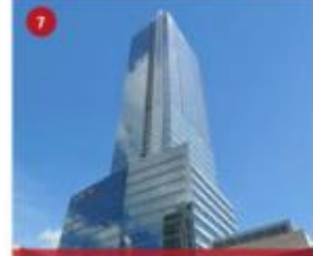
Four Seasons Hotel & Tower Year built: 2003 Height: 70 stories