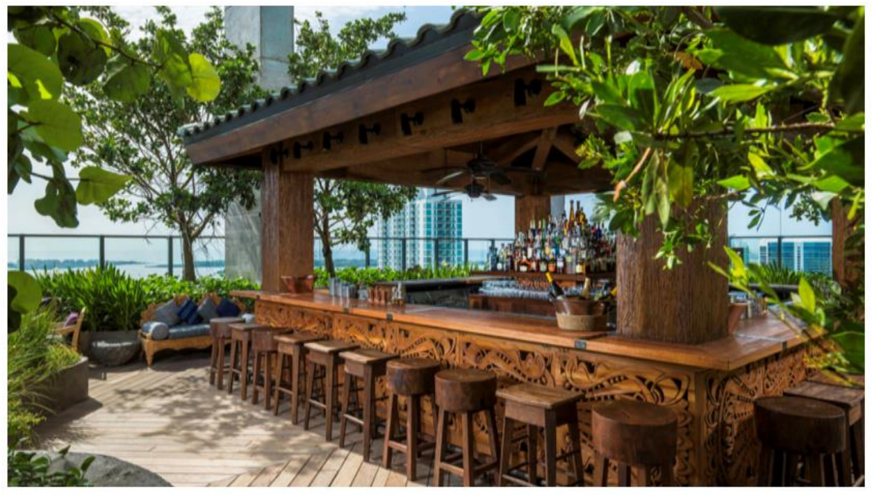
Sugar at the East, Miami.