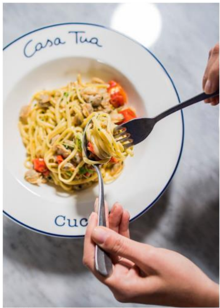
Casa Tua Cucina

"I walk through Casa Tua Cucina a couple of times a day to say hello to clients or people from the community. It's become a go-to for lunch or dinner. The tuna or salmon tartare, tagliolini alle vongole, and churrasco are consistently my top picks." 70 Southwest Seventh Street; 305-755-0320; casatuacucina.com.