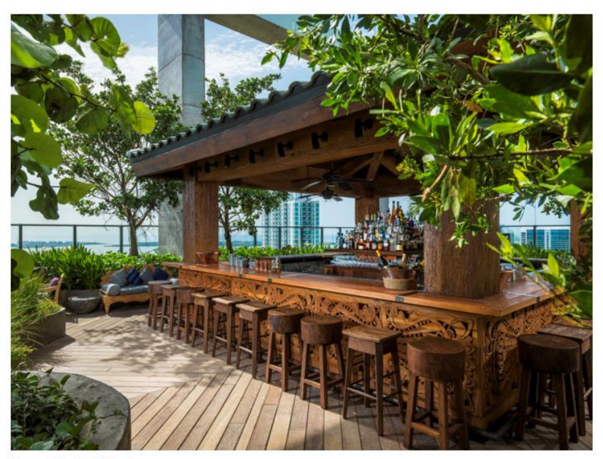
Sugar at the East, Miami.