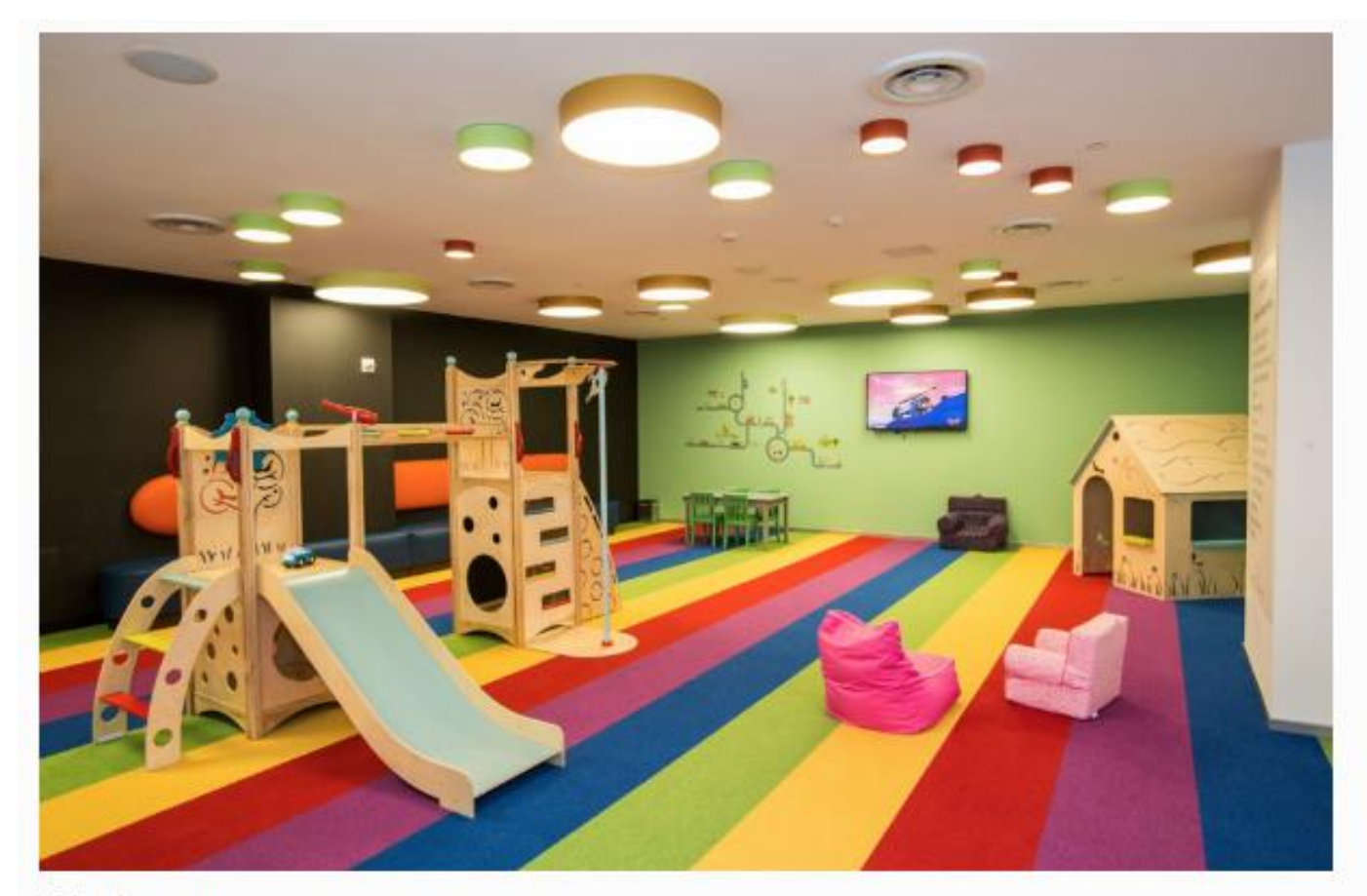
Kids playroom