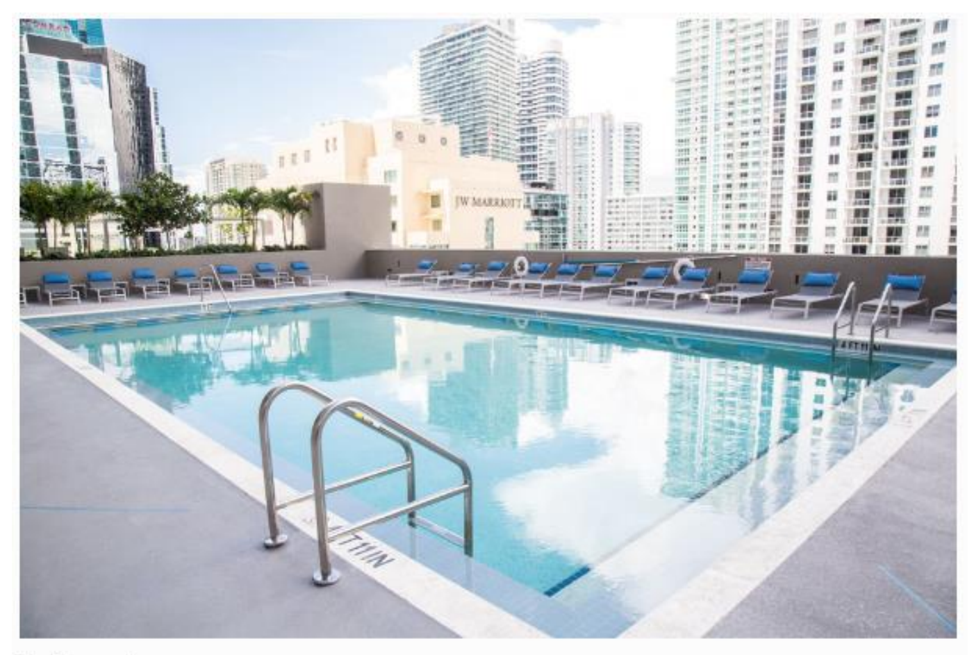
Rooftop pool