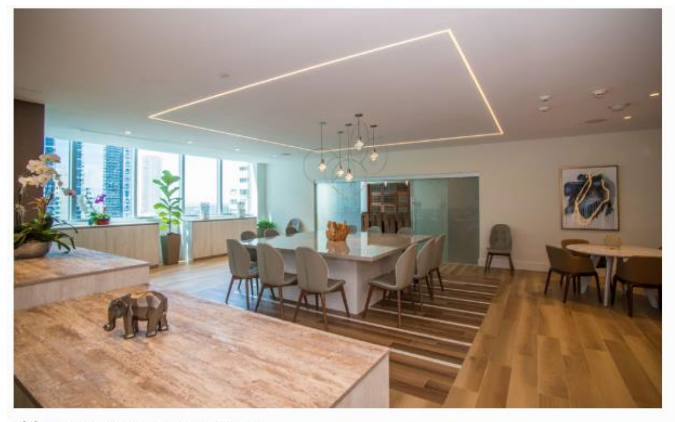
Dining space

Panorama has a reputation to live up to. Billed as Miami's highest level of living, the grand mixed-used tower is above it all. About 90% of the condo-level residences offer water views of the Biscayne Bay and Atlantic Ocean via hurricane-resistant, floor-to-ceiling window walls and expansive balconies with glass railings. Residences here run a tad larger—one bedrooms start at 1,100 square feet; two bedrooms start at 1,600 square feet; and three bedrooms start at 2,100 feet.