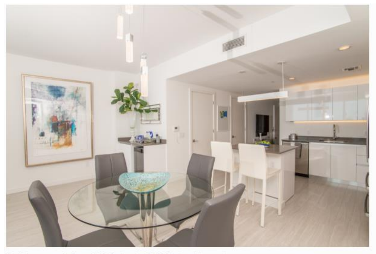
Residences range from 1,100 feet up to 2,100 feet and beyond.

Residents can also enjoy a range of luxury amenities from three theaters, exercise studios, kids play room, pampered dog run, pools, bars, private dining room, cyber cafe, social lounges, music studio, and a game room with golf simulator.