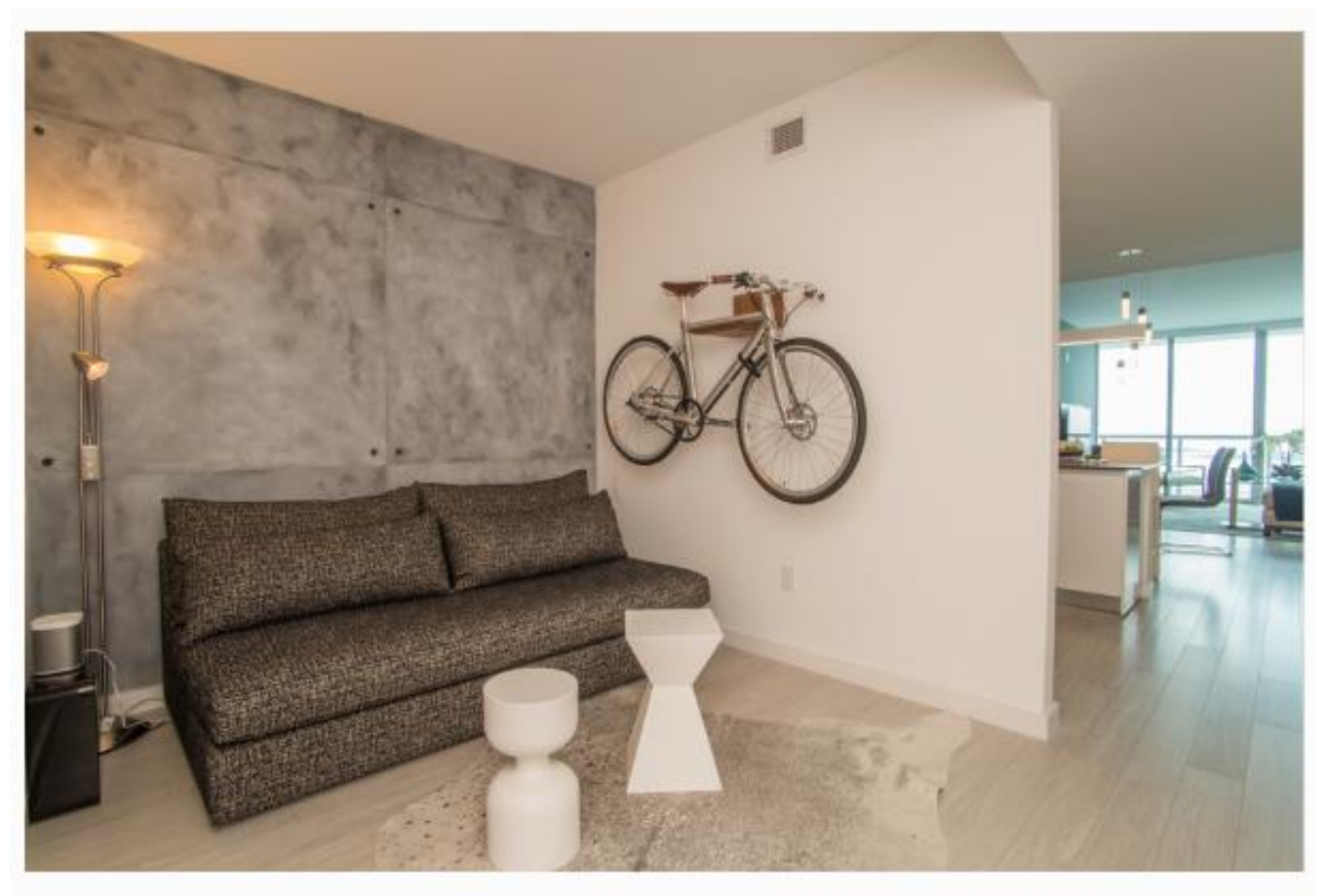
Open living spaces and convenient living courtesy of PANORAMA TOWER