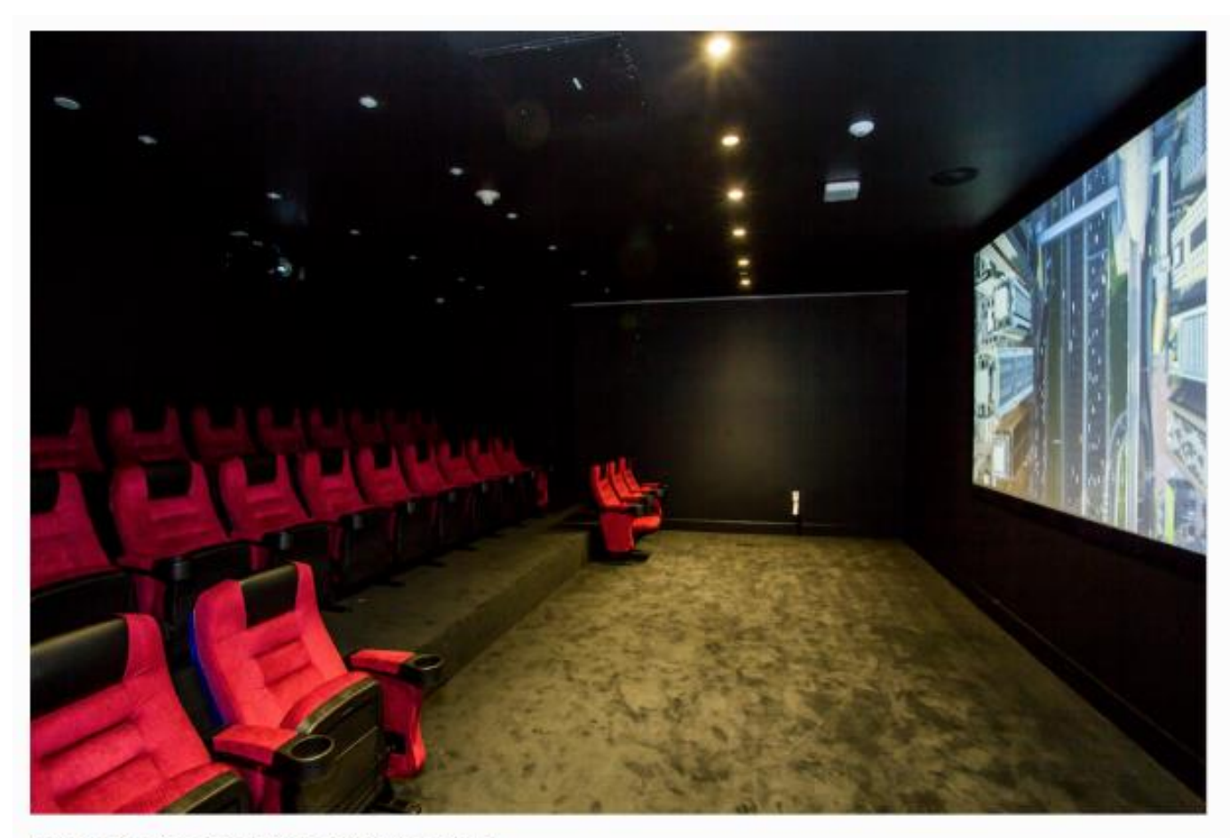
Movie theater