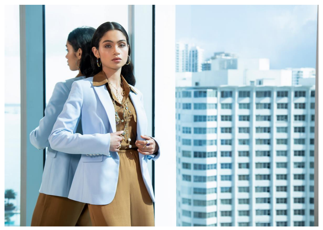
Jacket by Veronica Beard and top & pants by Vince @ Nordstrom, Aventura Mall. Jewelry by Diamonds On The Key.