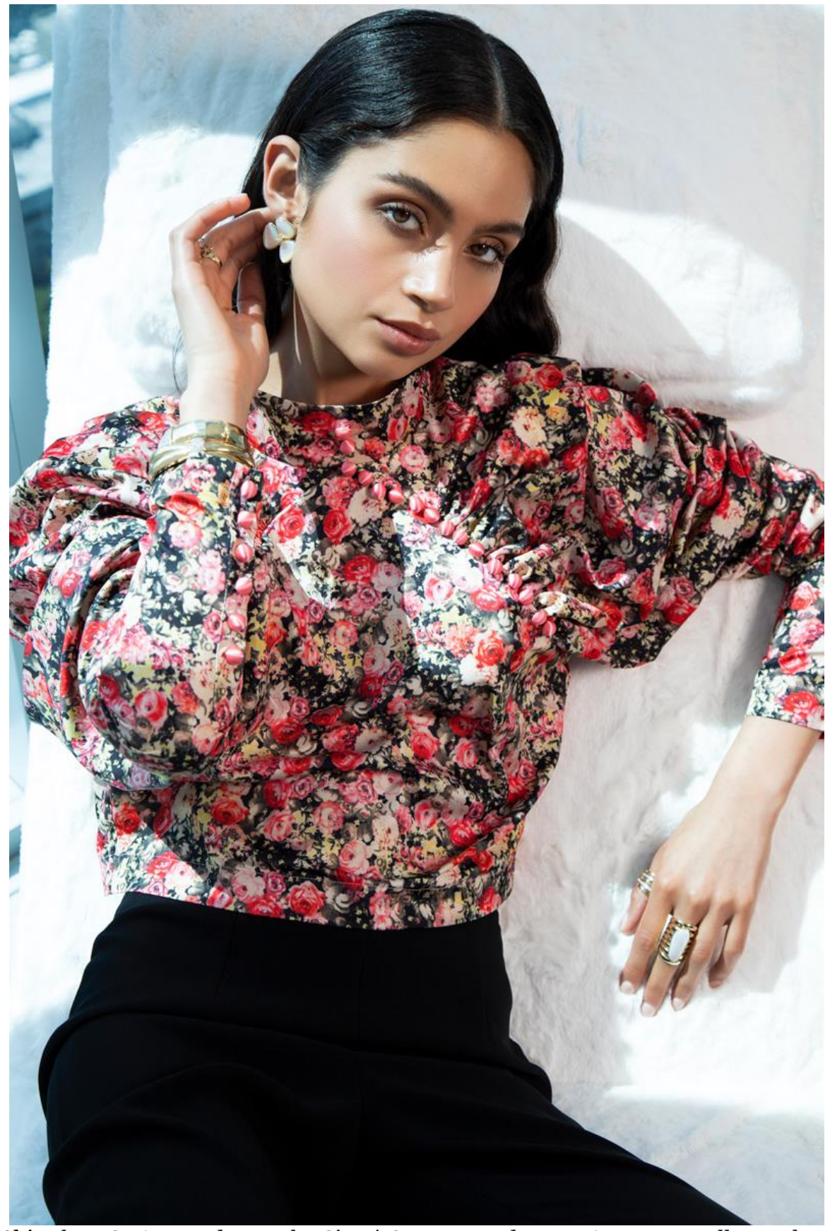
Shirt by ROTATE and pants by Cinq à Sept @ Nordstrom, Aventura Mall. Jewelry by Diamonds On The Key.