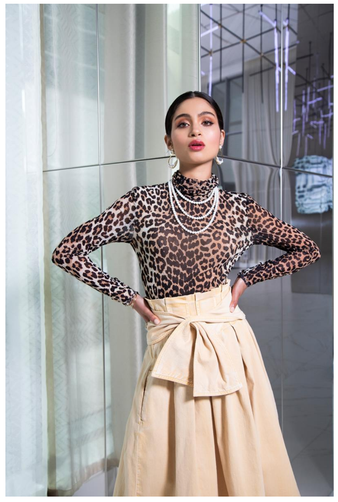
Top by Ganni and skirt by Ulla Johnson @ Nordstrom, Aventura Mall. Jewelry by Diamonds On The Key.