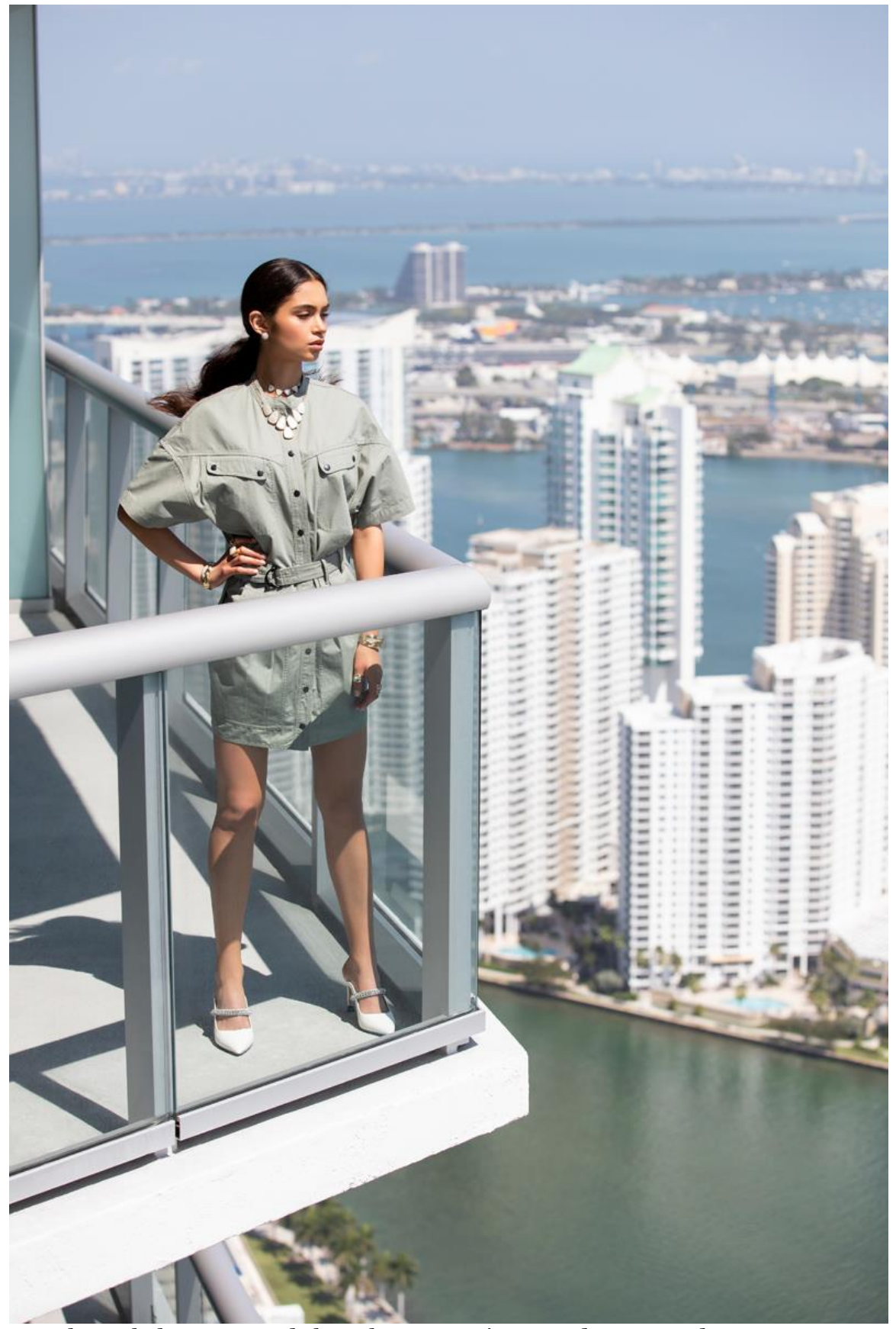
Dress by Isabel Marant and shoes by Kurt Geiger London @ Nordstrom, Aventura Mall. Jewelry by Diamonds On The Key.