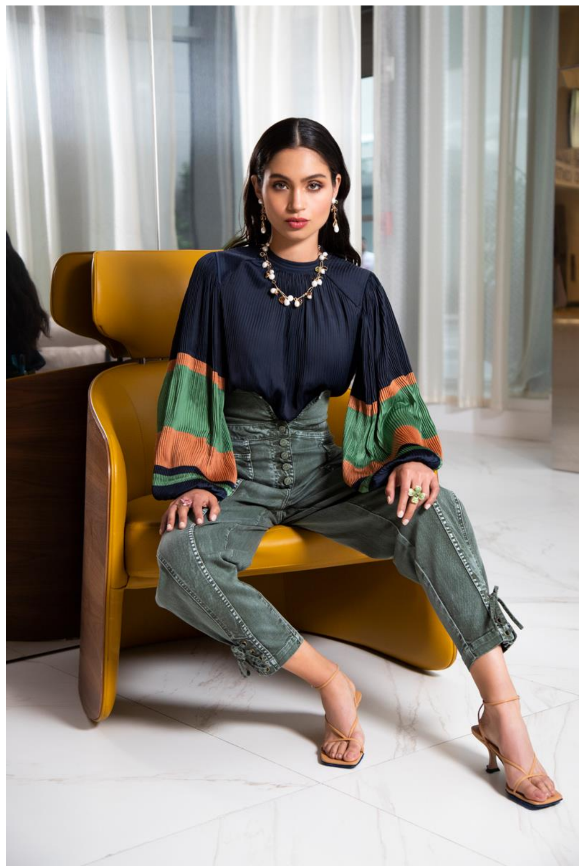
Top and pants by Ulla Johnson and shoes by Jeffrey Campbell @ Nordstrom, Aventura Mall. Jewelry by Diamonds On The Key.