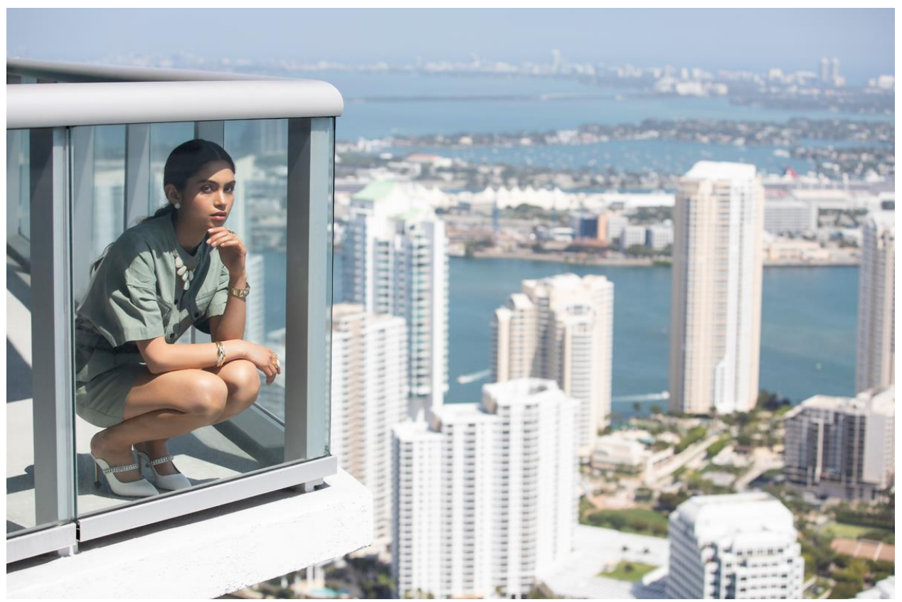
Dress by Isabel Marant and shoes by Kurt Geiger London @ Nordstrom, Aventura Mall. Jewelry by Diamonds On The Key.