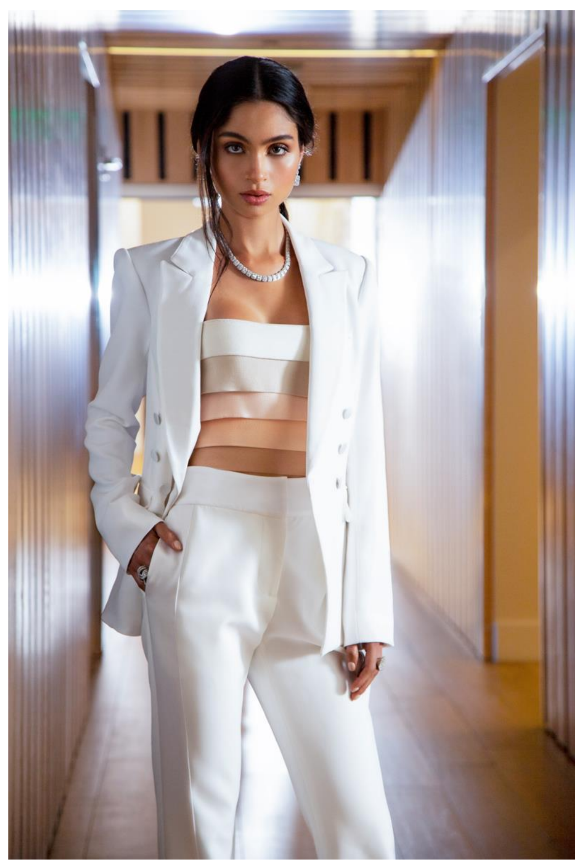
White suit by Jonathan Simkhai @ Nordstrom, Aventura Mall. Cropped top by LOLITTA. Jewelry by Diamonds On The Key.