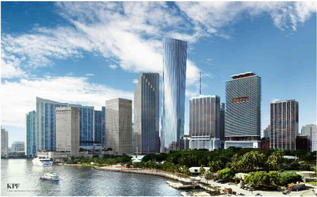
An older Kohn Pedersen Fox design for the tower approved in 2017:

The website reported that Kohn Pedersen Fox is the architect, with apartments, retail, and hotel also planned.