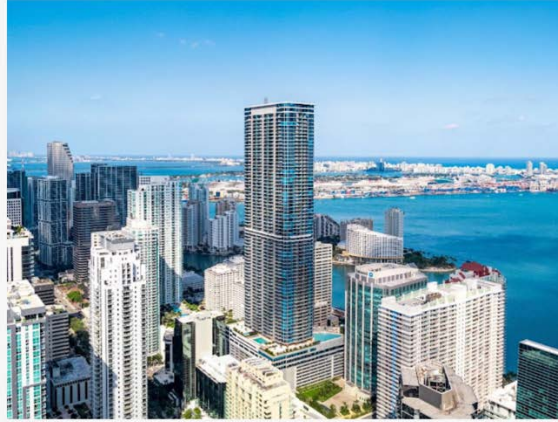
Panorama Tower rises 85 stories over the Miami skyline

Colliers South Florida Appointed to Lease Remaining Office/Retail Space at Panorama Tower in Miami, FL