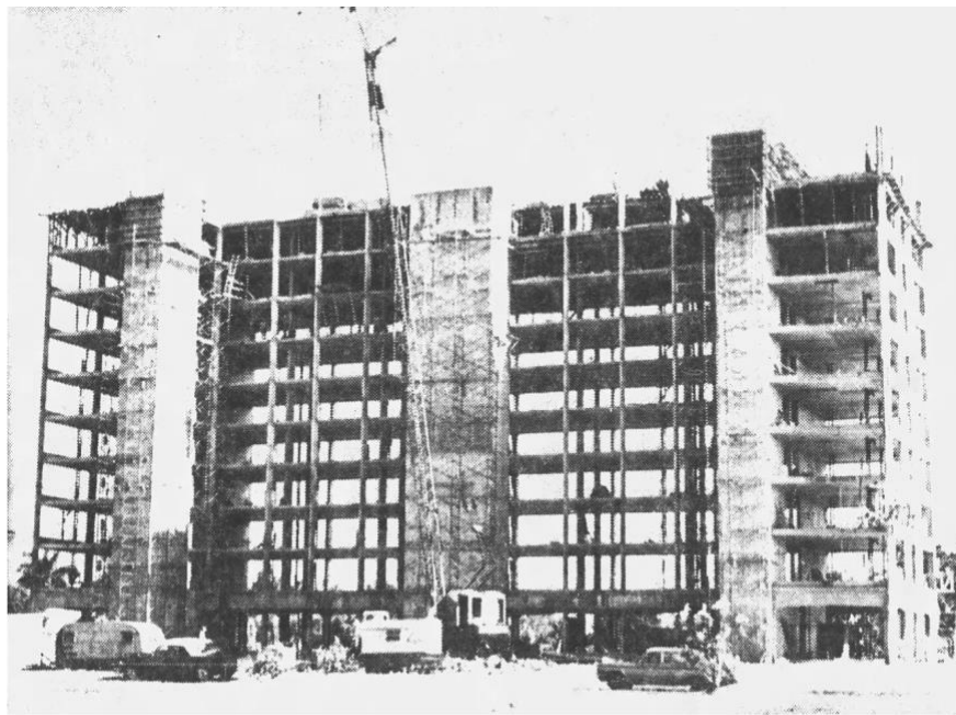
The 1965 construction of Bonair Towers in Fort Myers.

Before that, the 11-story “Fort Myers Housing Authority edifice at 1915 Halgrim served as the tallest structure in the city when it debuted in 1965,” according to a April 8, 2024, News-Press article written by Phil Fernandez. Known as Bonair Towers, it “cost of $1.1 million” and “its pilings had a total combined length of nearly three miles.”