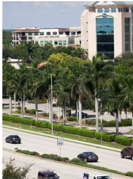
The Fifth Third Center, near the corner of U.S. 41 and Vanderbilt Beach Road, can be seen from another high rise just south Wednesday, September 21, 2016 in Naples. The structure, along with the Iberia Bank building on the corner of Goodlette-Frank Road and Golden Gate Parkway, is the tallest in Naples.

Before that, the Iberia Bank building, on the corner of Goodlette-Frank Road and Golden Gate Parkway, and the Fifth Third Center on U.S. 41 and Vanderbilt Beach Road, were said to be the tallest, according to a Sept. 22, 2016, filing in the Naples Daily News .