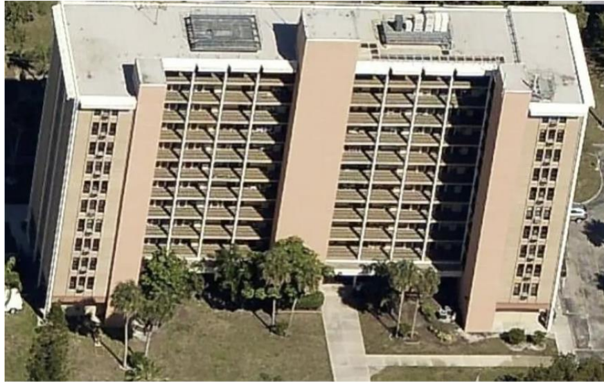
Bonair Towers in Fort Myers; date unknown.

feet, according to the council on Tall Buildings and Urban Habitat. Construction started in 2004 and was completed in 2007. It is located at 2104 West First Street.