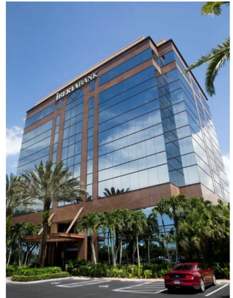
The Iberia Bank building, on the corner of Goodlette-Frank Road and Golden Gate Parkway, can be seen from the ground Wednesday, September 21, 2016 in Naples. The building, along with the Fifth Third Center on U.S. 41 and Vanderbilt Beach Road, is the tallest in Naples.