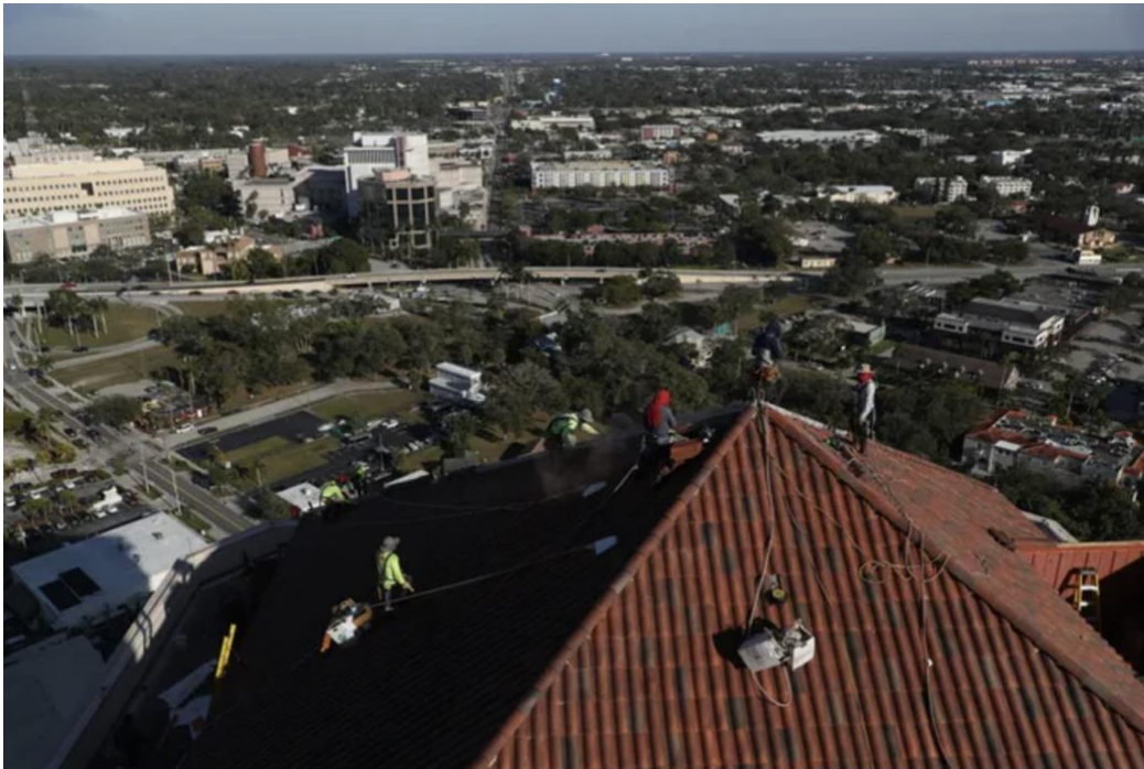
The roof of High Point Place in downtown Fort Myers is being replaced after it was damaged by Hurricane Irma in 2017. The tallest of five buildings stand at 32 stories high and are the tallest buildings between Miami and Tampa. The roof on all the buildings are being replaced by Crowther Roofing.

The tallest building on the West Coast of Florida soars above St. Petersburg's skyline – The Residences at 400 Central at 515 feet.