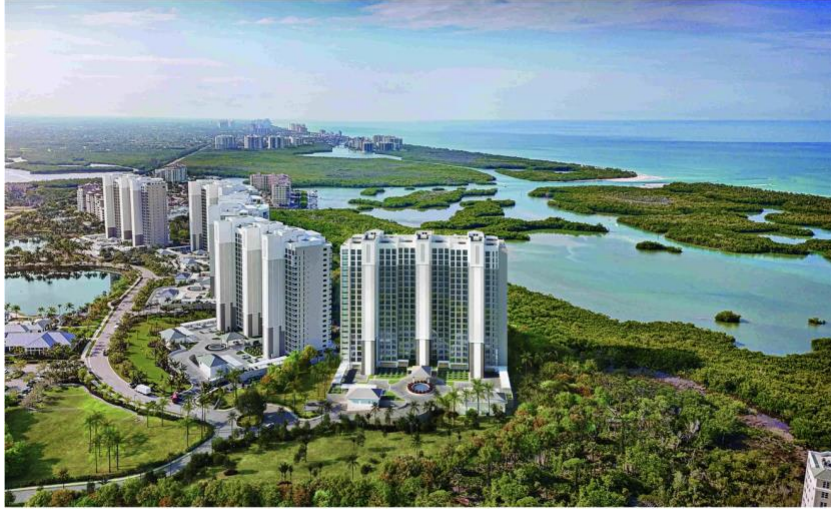
The towers at Kalea Bay, North Naples.