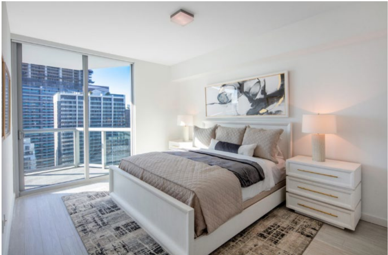
Model Unit Master Bedroom w/ View