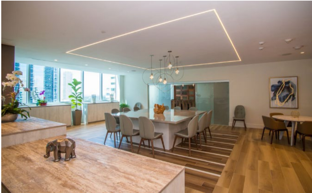
Private Dining Room

They have also responded to the on-demand nature of millennials who are used to services such as Uber and Instacart. “We purposely built Panorama Tower with this in mind where residents really never need to leave the building,” says Hollo. The building offers a full, private floor with over 45,000 square feet of residential amenities and recreational facilities. Residents enjoy a wide array of extraordinary amenities, including three movie theaters, a wine tasting room, and state-of-the-art fitness center complete with yoga, Pilates, spinning studios, a soundproof “Muse Room” for live music and recording sessions and two large social lounges. Additionally, Dogtown Brickell is the newest pet hotel and spa, with facilities for grooming services, daycare and overnight boarding in the Brickell neighborhood. “With the on-the-go nature of our residents, Dogtown will serve a convenient everyday need and provide a trusted and safe haven for our four-legged friends,” he says.