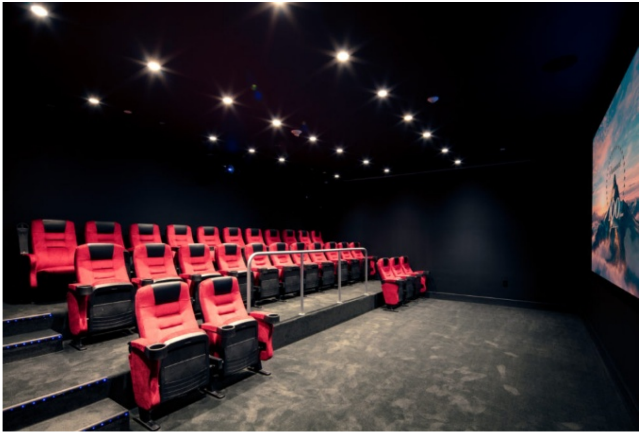
Private Residential Theatre